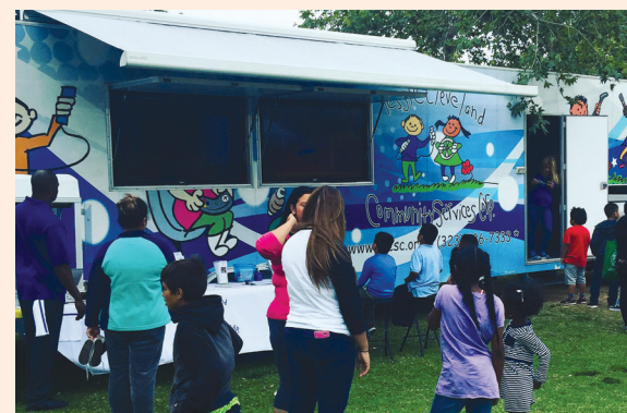
Families enjoying the game truck provided by Tessie Cleveland Community Services Clinic.

Clinic, Los Angeles Child Guidance Clinic, and University Muslim Medical Association Community Clinic to provide services. The program offered wellness activities and positive mental health talks, using informal discussion groups and workshop activities to discuss mental well-being. Programs were tailored to community needs and included the mental health mobile game truck, healthy cooking classes, health screenings for older adults, art therapy, fotonovelas, and stress management classes. Mental health screenings and linkage to services were offered during these events.