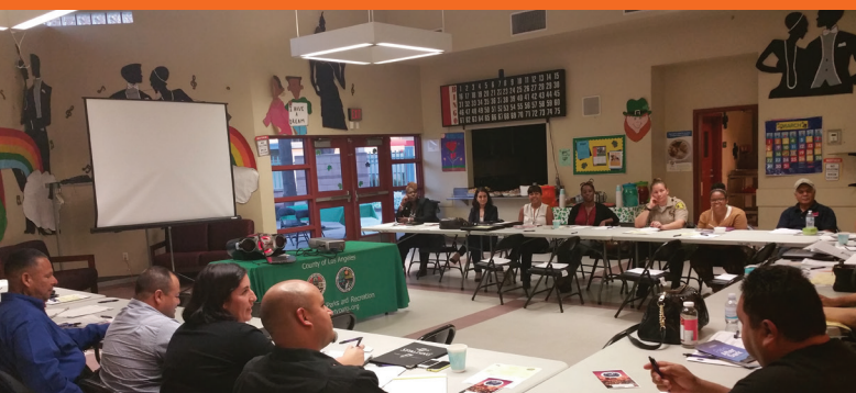
PAD stakeholder engagement and planning meeting at Roosevelt Park.

PAD originated when community members identified the need for summer park programming during the County’s Gang Violence Reduction Initiative planning process in 2009. Each year, DPR conducts stakeholder planning and debriefing meetings at the parks, then uses feedback from participant surveys to shape and improve programming. Regional and park-level planning meetings convened in the