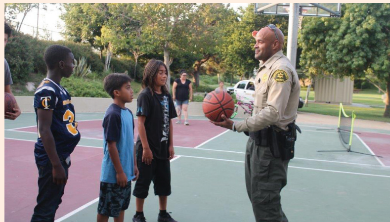
Deputy Sheriff teaching PAD youth basketball skills at Amigo Park.