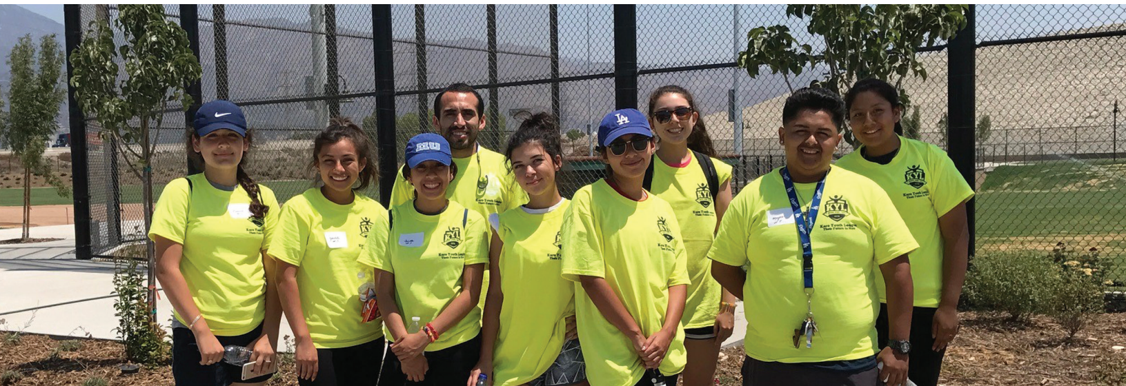
Youth workers getting ready for PAD at Pamela Park.

The appointment of a PAD Coordinator in 2016 significantly improved outreach, partner communication, and cross-sector collaboration. Pilot programs, including those highlighted in this report (such as Park Therapy, the Probation Enrichment Program, and Community Intervention Workers), demonstrate the potential of innovative on-site services to address PAD community needs. However, additional effort is needed to sustain and expand initial efforts.