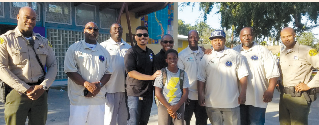
Deputy Sheriff with Community Intervention Workers at Watkins Park.

“The interventionists interacted very well with both staff and the public at the park. They . . . worked alongside [Deputies] to keep the park safe. They were very good at detecting potential conflicts and resolving them immediately so that situations did not escalate.”