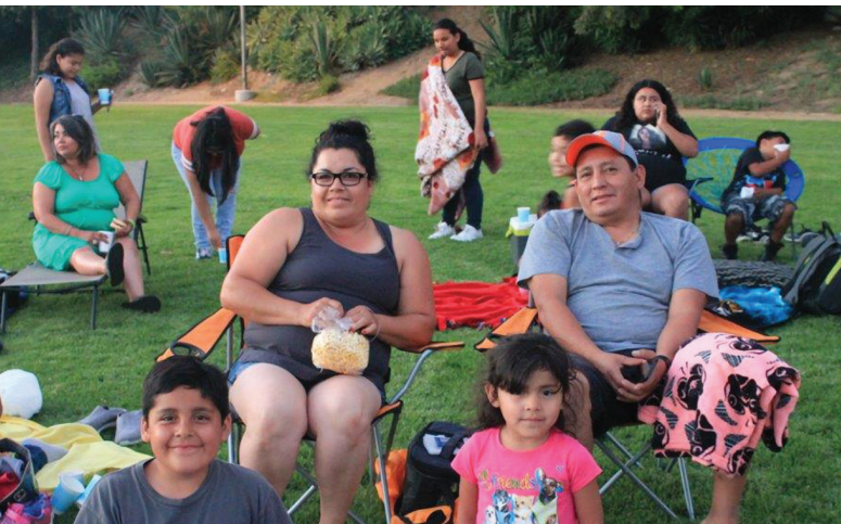
Family spending time together at PAD Movie Night at Amigo Park.

“I’m glad to see my neighbors come together.”