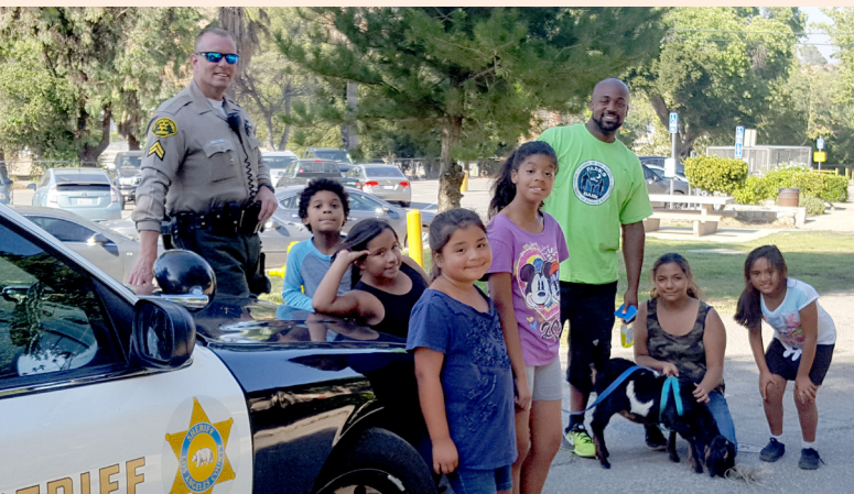
Deputy Sheriff with PAD youth participants at Val Verde Park.