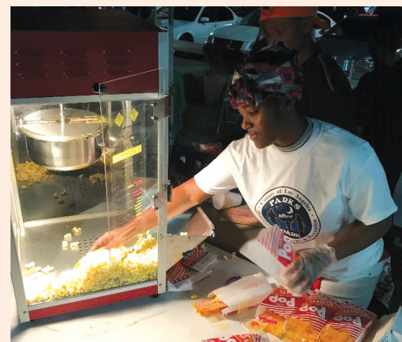
Youth volunteer serving popcorn during Movie Night at East Rancho Dominguez Park.